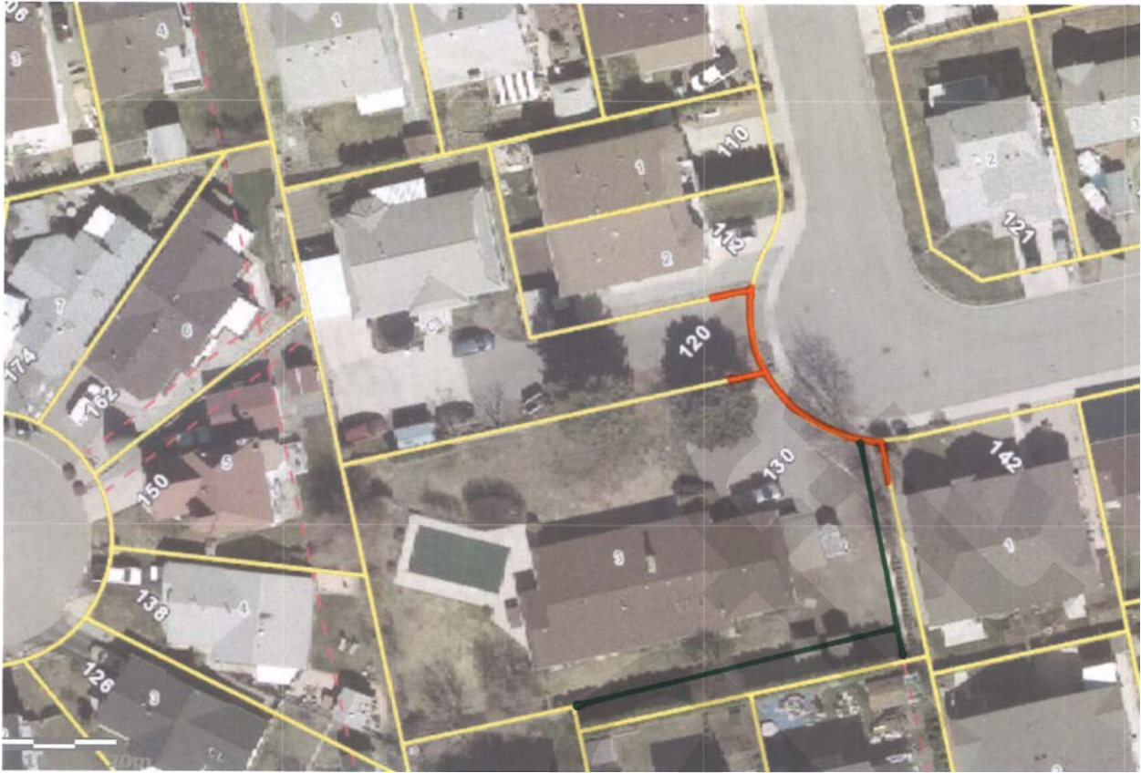
Sample fence and Gate