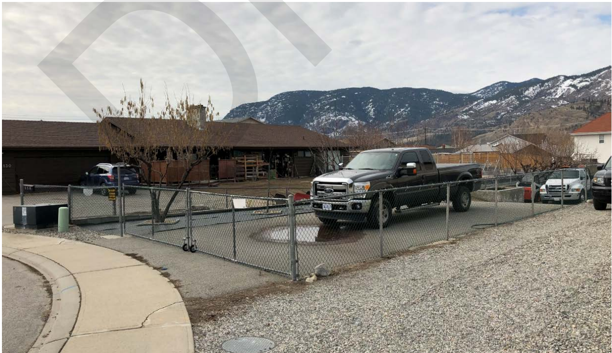
Figure 2: Image from Wyles Crescent looking south west, chain link to be replaced with higher decorative fencing