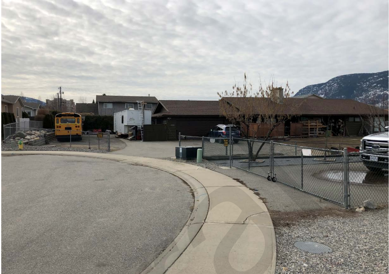
Figure 1: Image of subject properties from Wyles Crescent looking south